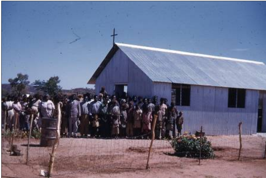
People outside the church on Napperby Station. Photograph taken 1960c.

The Mission Truck would generally arrive in the afternoon, that night films would be shown and the church service would be conducted the following morning. The services varied in format and location, some were conducted inside the community church and others were held outdoors. Church services were conducted in Arrernte and hymns were also were also sung in Arrernte (Schrapel, 1969:12). After the service people sometimes attended baptism and confirmation classes (Henson, 1992: 225).