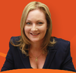
Delia Lawrie LEADER OF THE OPPOSITION