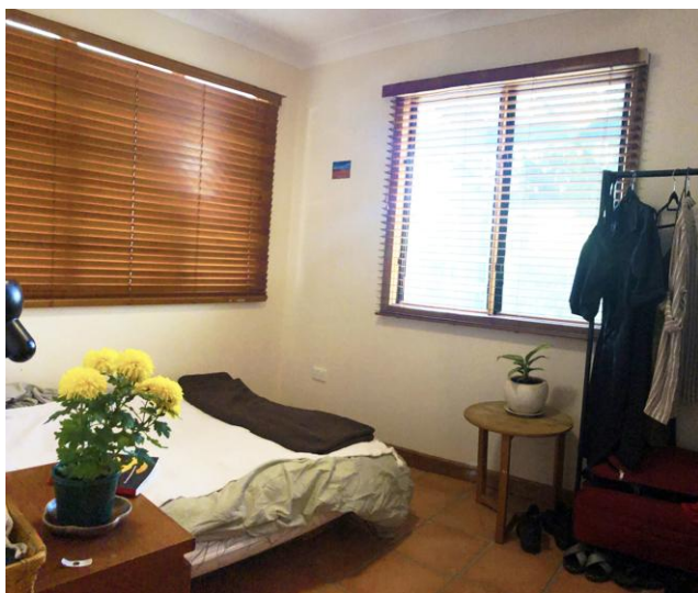
House features four good sized bedrooms.