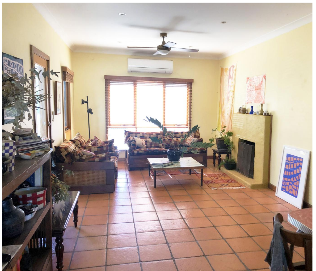
Lovely airy open plan lounge has split systems air conditioning.