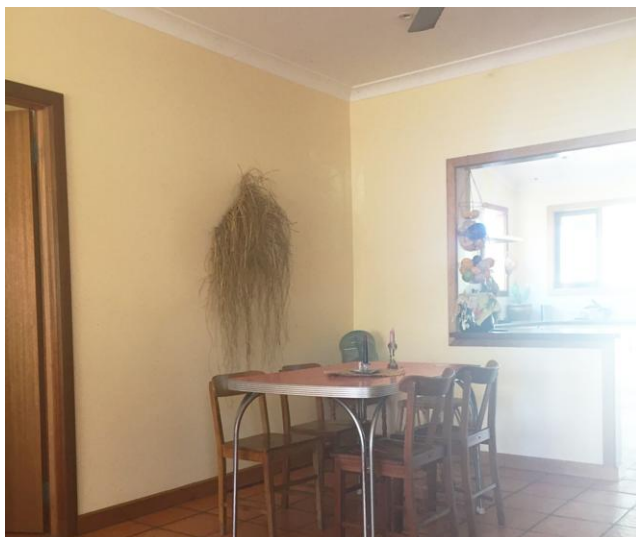
Open fireplace dining is a key feature of the house

the four good sized bedrooms, there are split system air conditioners in some of the bedrooms. The bathroom includes a shower, bath and vanity with a separate toilet. There is an undercover carport and a garden shed, and a veggie garden.